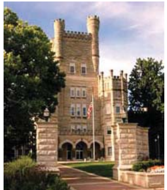
Old Main featured on the cover of exhibit brochure.

The exhibition consists of documents and images from the past 150 years of Illinois' educational history and will be on display from October 12 to December 10, 2010.