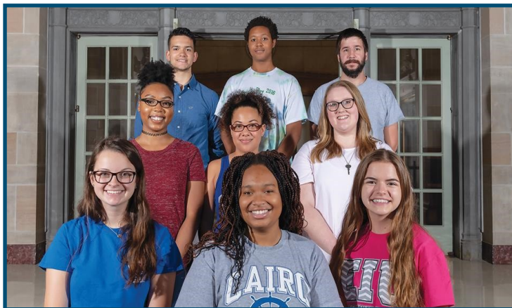
Sociology/Anthropology Club Members