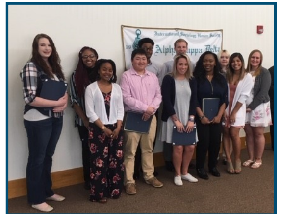
AKD Members at the Sociology/Anthropology Honors Reception

We were very proud to induct 18 new members at our annual Departmental Honors Reception in April. We also held two fundraisers to support the American Red Cross National Hurricane Relief efforts and the Child Advocacy Center in Coles County. We had several members who participated in the Tunnel of Oppression and one of the members led an activity teaching about racial injustices. Finally, we had multiple guest speakers talk to our members about a wide range of topics, from career opportunities to graduate school. These campus and community service activities and dedication to volunteerism are trademarks of our chapter and a testament to the character of EIU students. EIU AKD is truly making a difference.