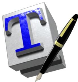
\text{T}_{\text{E}}\text{X} works Mac, Windows, Linux