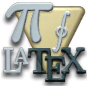
\text{T}_{\text{E}}\text{X} Shop Mac