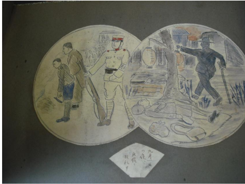
Figure 3. The soldier and night time patrol by a vigilante . Collection of children's drawings for the first anniversary of the Great Kantō Earthquake (Sakamoto Elementary School, Tokyo). Original housed in the Reconstruction Memorial Hall, Tokyo.