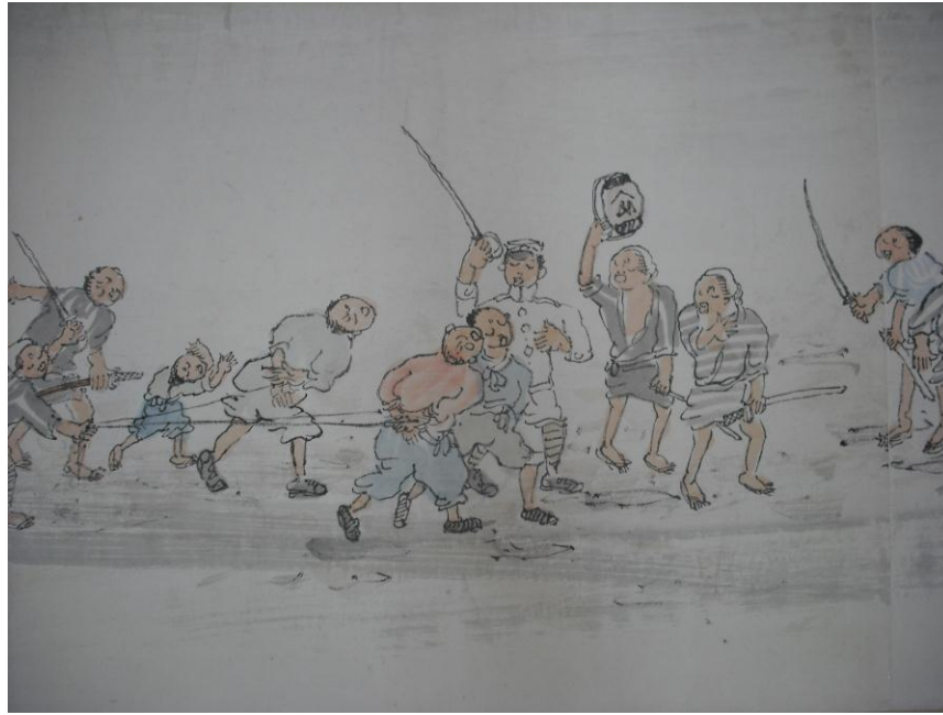
Figure 8. Kayahara Hakudō, Visual Records of the Great Earthquake in Eastern Capital ( Tôto daishinsai kaganroku ). Picture scroll vol. 3. Original housed in the National Museum of Japanese History, Chiba..

These visual texts, in one way or another, indicate the significance of these artists' experience of the massacre of Koreans weighed heavily in their minds. They also demonstrate the close involvement of the soldiers, police, war veterans, and local fire brigades and other vigilante members in the massacre of alleged futei senjin . These actors were often identified by their uniforms and other clothes. While the Koreans still seem to remain largely nameless, faceless, and voiceless in these depictions, at least their existence in these visual records indicate the clear presence of the massacre memory in the minds of those who experienced the violence. Indeed, the Japanese state worked so hard and meticulously to argue that it was the vigilantes who carried out the massacre and not the