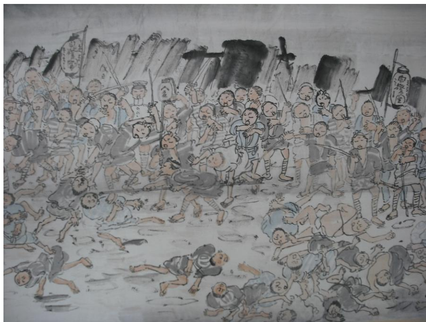
Figure 7. Kayahara Hakudō, Visual Records of the Great Earthquake in Eastern Capital (Tōto daishinsai kaganroku) . Picture scroll vol. 3. Private Collection of Hakudō family.