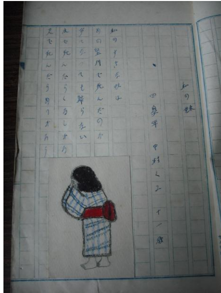
Figures 4-5. Collection of children's earthquake memoirs. Yokogawa Normal Elementary School. Original housed in the Reconstruction Memorial Hall, Tokyo.

The violence was too vivid to be ignored, not only by the children but also by artists who survived and witnessed both the natural and manmade disasters. While photographs or printed matters were strictly censored avoiding mentioning of the massacre of Koreans, individual drawings and paintings were easier to create and preserve once artists decided to capture what they had seen in the form of drawings or paintings. These visual records include a contemporary entrepreneur's picture scroll which recorded a scene of the harassment of Koreans as futei senjin . The text tells the content of the rumors and the violent reaction to the alleged futei senjin by the Japanese citizens. It shows the direct involvement of police as well as a citizen in cracking on Koreans (in white summer uniforms). There are five passers-by who must have been witnesses of the scene. One