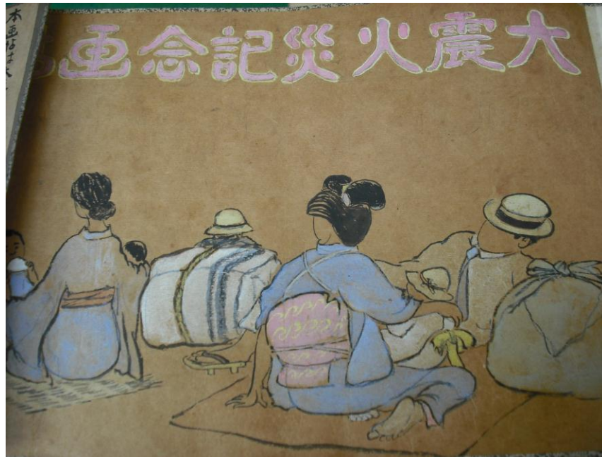
Figure 2. Collection of children's drawings for the first anniversary of the Great Kantō Earthquake (Sakamoto Elementary School, Tokyo. Original housed in the Reconstruction Memorial Hall, Tokyo.