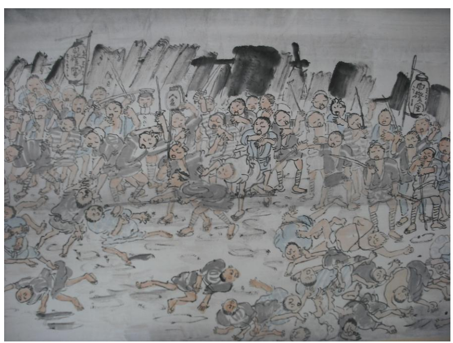
Figure 7. Kayahara Hakudō, Visual Records of the Great Earthquake in Eastern Capital (Tôto daishinsai kaganroku). Picture scroll vol. 3. Private Collection of Hakudō family.