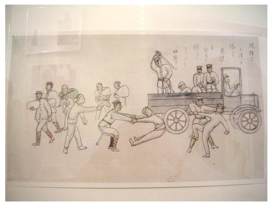
Figure 6. A contemporary Japanese entrepreneur's picture scroll of the 1923 Earthquake.

Japanese citizens. It shows the direct involvement of police as well as a citizen in cracking on Koreans (in white summer uniforms). There are five passers-by who must have been witnesses of the scene. One wonders where the police force is dragging the four Koreans whose faces are intentionally left blank. [Figure 6].