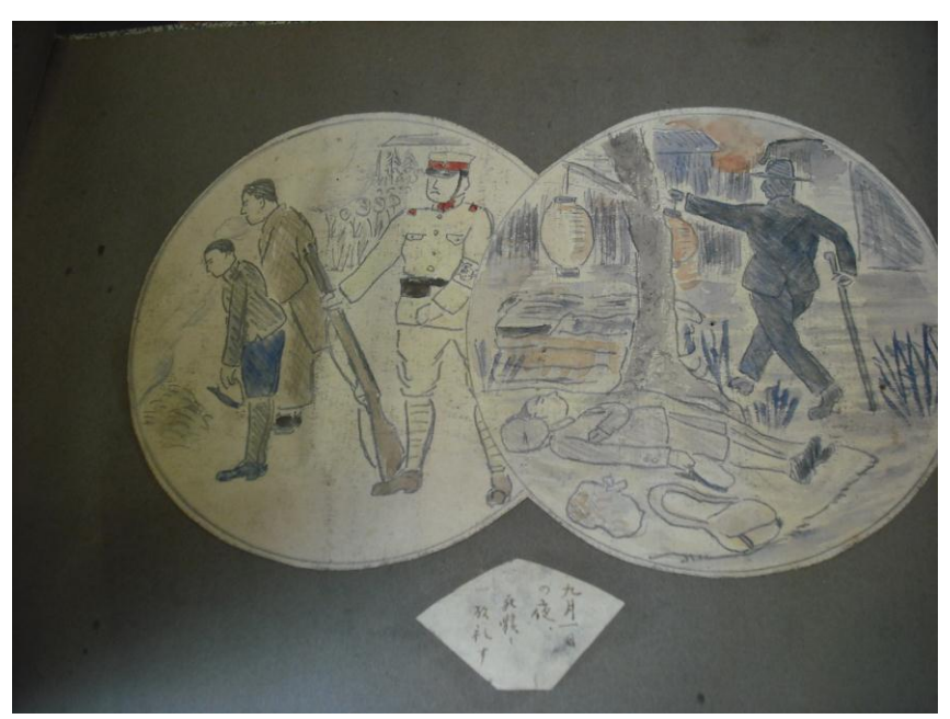
Figure 3. The soldier and night time patrol by a vigilante. Collection of children's drawings for the first anniversary of the Great Kantō Earthquake (Sakamoto Elementary School, Tokyo). Original housed in the Reconstruction Memorial Hall, Tokyo.