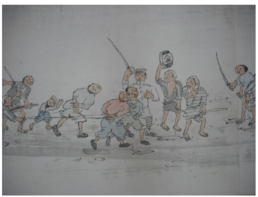
Figure 8. Kayahara Hakudō, Visual Records of the Great Earthquake in Eastern Capital (Tôto daishinsai kaganroku). Picture scroll vol. 3. Original housed in the National Museum of Japanese History, Chiba, Japan.

These visual texts, in one way or another, indicate the significance of these artists' experience of the massacre of Koreans weighed heavily in their minds. They also demonstrate the close involvement of the soldiers, police, war veterans, and local fire brigades and other vigilante members in the massacre of alleged futei senjin . These actors were often identified by their uniforms and other clothes. While the Koreans still seem to remain largely nameless, faceless, and voiceless in these depictions, at least their existence in these visual records indicate the clear presence of the massacre memory in the minds of those who experienced the violence. Indeed, the Japanese state worked so hard and meticulously to argue that it