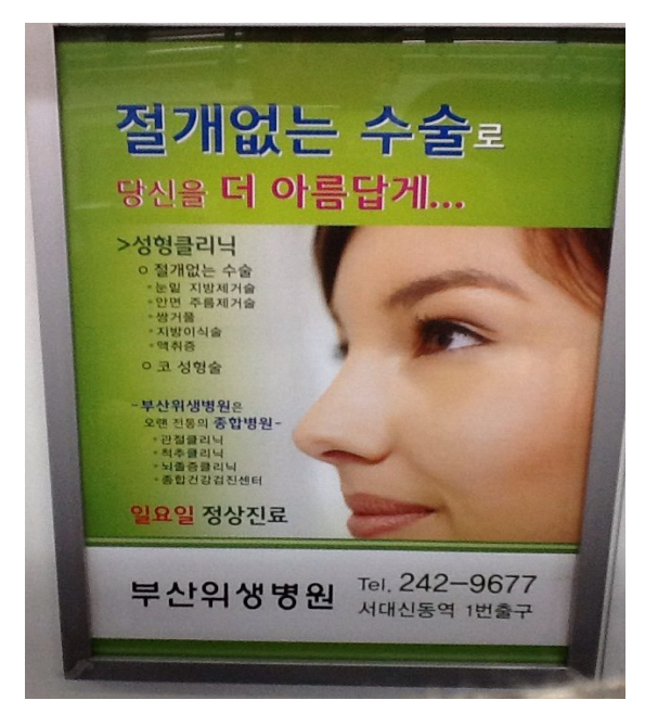
Figure 5: No Incision Plastic Surgery to Make You Prettier

It is worth noting that iterations of this trend can be observed in other Asian countries such as the Philippines, China, and Taiwan,