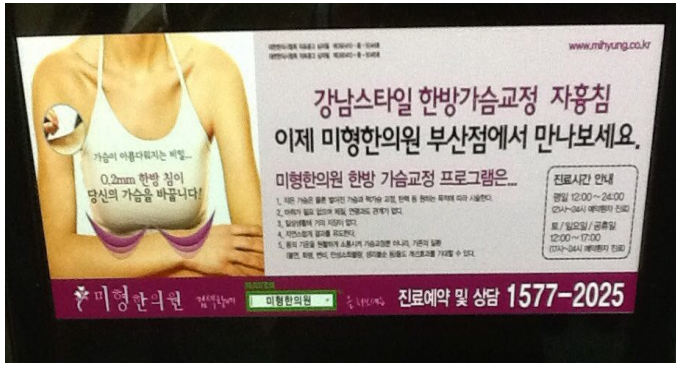
Figure 4: Breast Revisions "I Can Change Your Breasts"