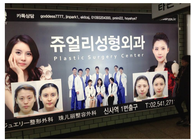
Figure 1: Plastic Surgery Center

have written about elsewhere.<sup>11</sup> This underground advertising is especially effective for the simple fact that subway riders are, literally, a captive audience. On average, Koreans spend an hour or more on the subway at any given time, which ultimately amounts to a lot of exposure to posters, advertisements, and videos. I snapped the photographs below (Figures 1-5) during my trip in November of 2013.