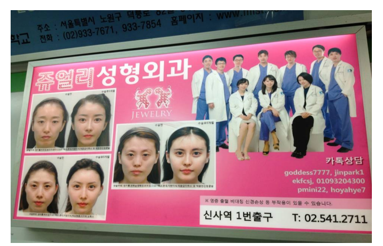
Figure 3: Jewelry Plastic Surgery