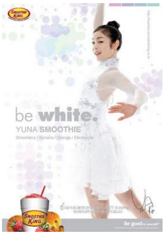
Figure 8: Yuna Kim, "Be White"

matters worse, they are spreading it further through their music videos, promotional materials, and product advertisements (see Figure 8). Websites like Asian White Skin (http://www.asianwhite skin.com/about.php) point to the need for more critiques of the model minority stereotype in Asian countries. Yuna Kim's Smoothie King poster, "Be White," is yet one more example of why more scholarship needs to be carried out that complicates the model minority stereotype in Asian countries.