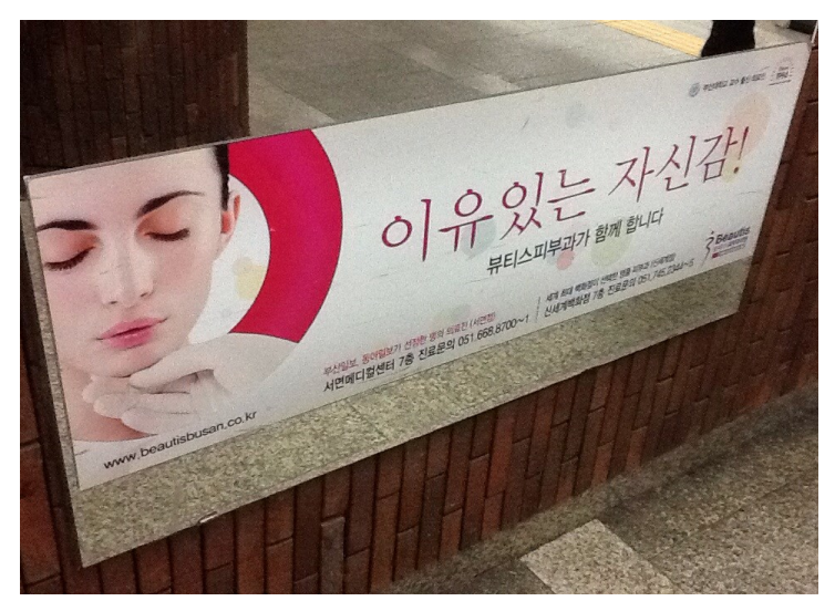
Figure 2: Reasonable Confidence